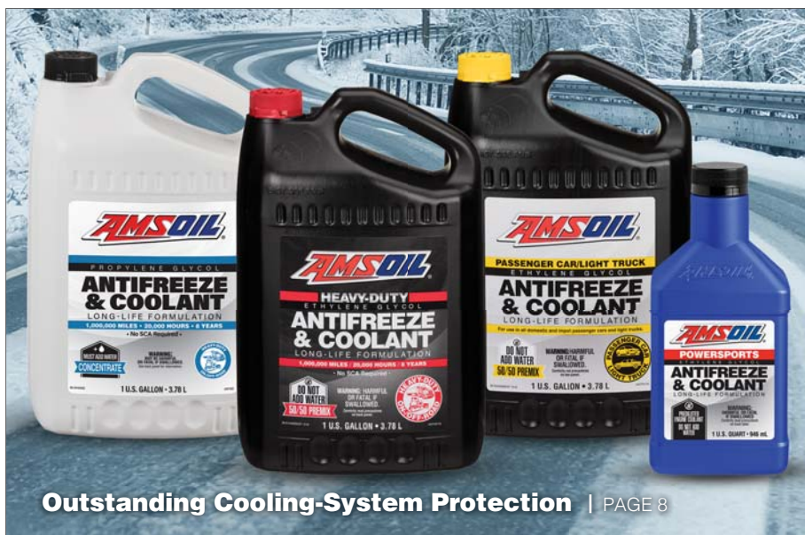
Outstanding Cooling-System Protection | PAGE 8