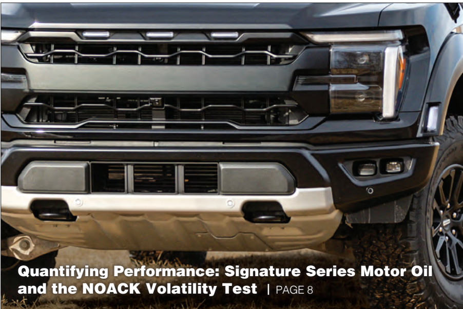
Quantifying Performance: Signature Series Motor Oil and the NOACK Volatility Test | PAGE 8